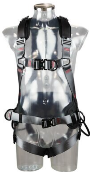
Work positioning D-ring